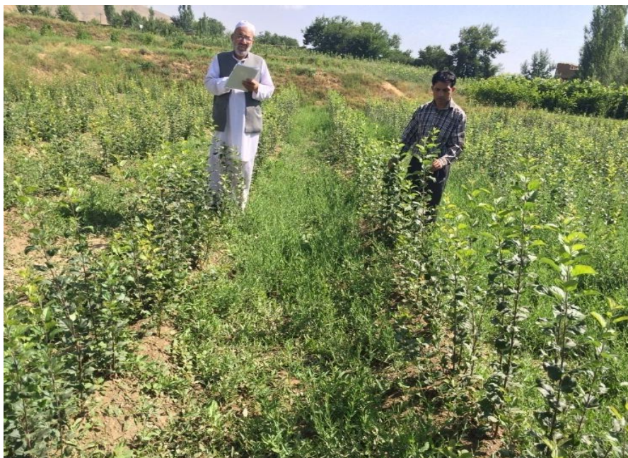
ANNGO inspectors during inspection of MSNs in Maidan province