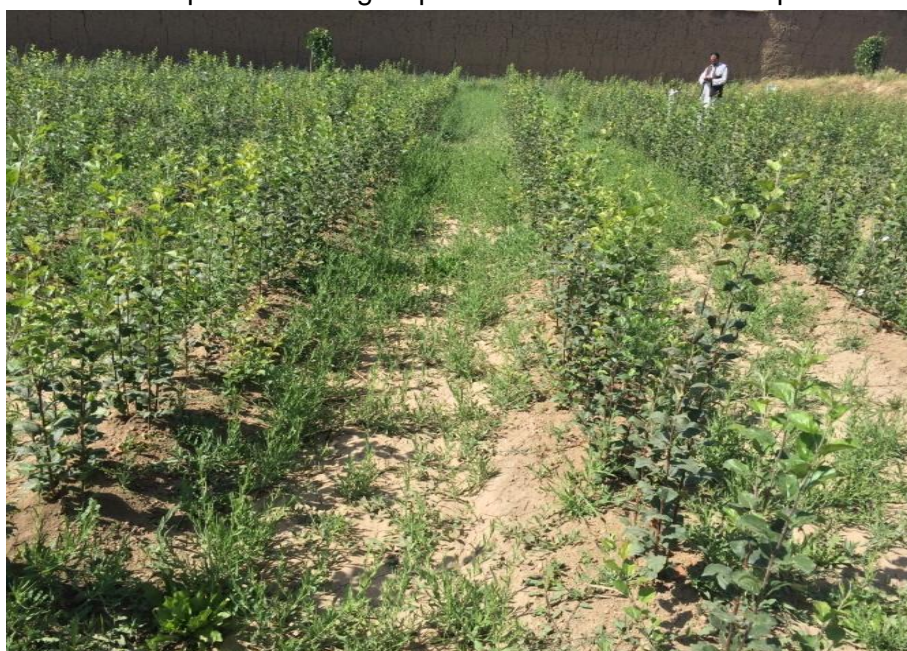
Apple clonal rootstocks newly planted for multiplication

Name of the contact person for the Action: Zainulabudin Noor