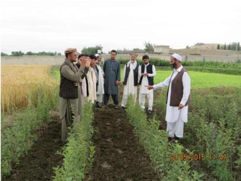
Laghman NGA chairman providing information about apple seedlings in his nursery.