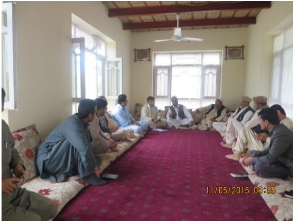
A group of newly hired Field Managers trained in Laghman NGA