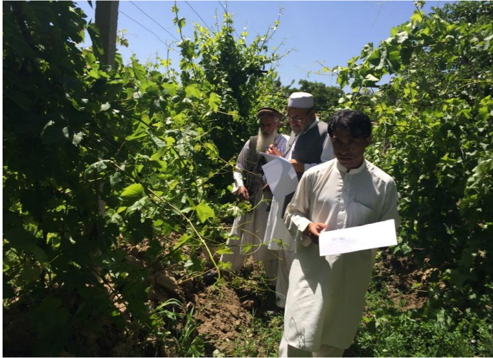
Inspection of grapes MSN in Bagram NGA

Name of the contact person for the Action: Zainulabudin Noor