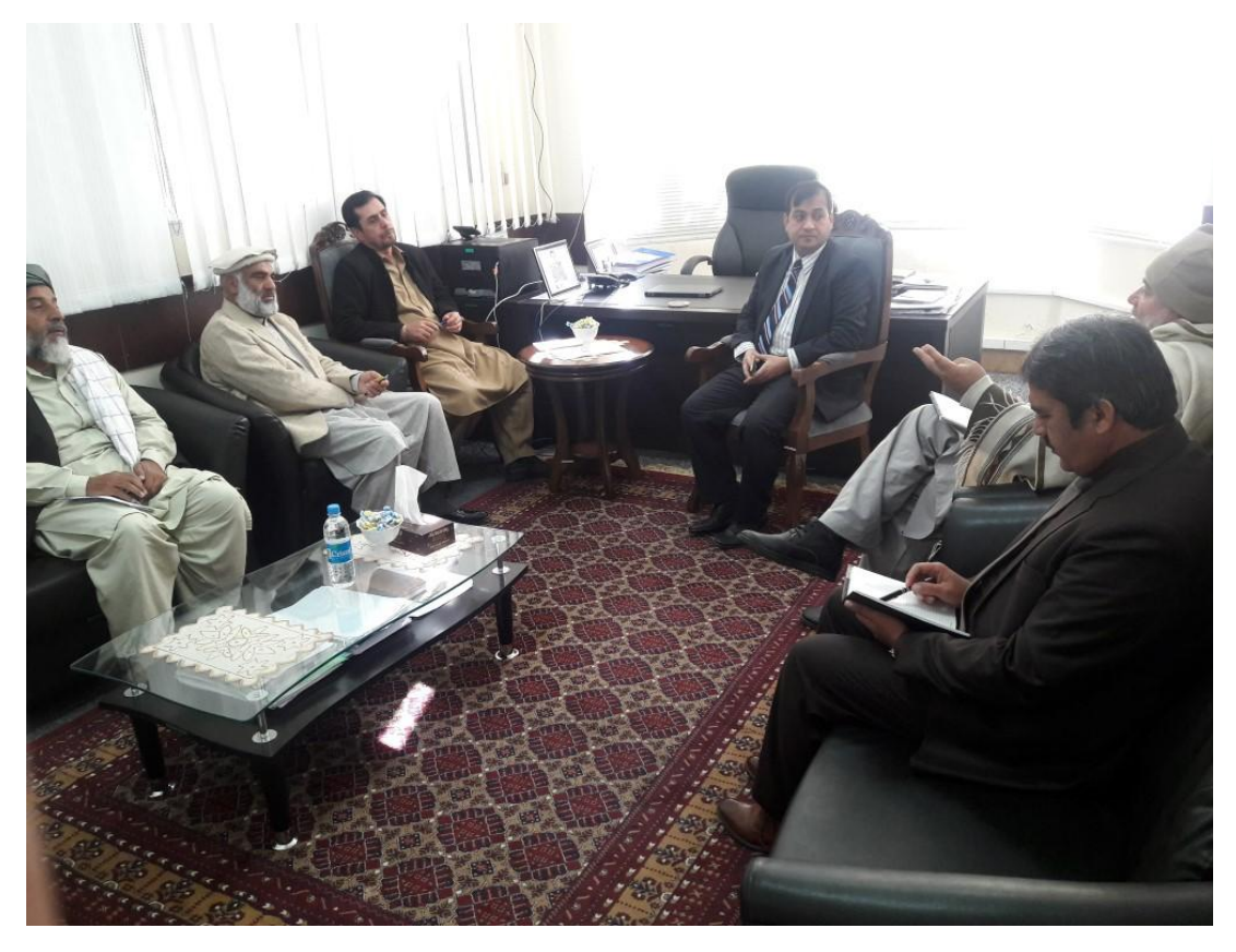
Photo # 5 ANNGO BoD and management team meeting with NHLP director and team

ANNGO BoD members and project management members also had meeting with NHLP director for better coordination and following of the procedure of procurement of NHLP/WB/MAIL. The main issue of the discussion was the fall campaign tree plantation of NHLP and the procedure of the procurement under the policy of MAIL and World Bank. As ANNGO is a certification body, so ANNGO will not be involve in the process of fixing the price. It was agreed that the price should be fixed based on the quality and variety of the saplings. NHLP will consider the ANNGO labels and the certified saplings (See picture # 5)