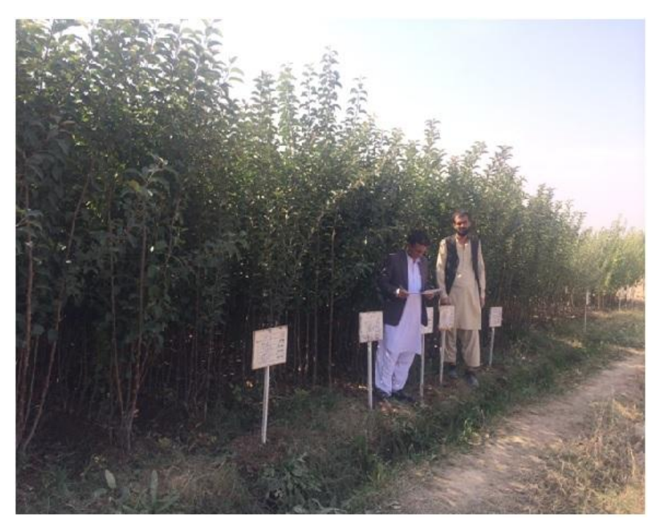
Photo # 2. Senior field inspector of ANNGO during the inspection of MSNs

As usual ANNGO field managers are working very close with nursery growers on regular basis and giving them the necessary information and technical advices. During these moths the below nurseries were visited: