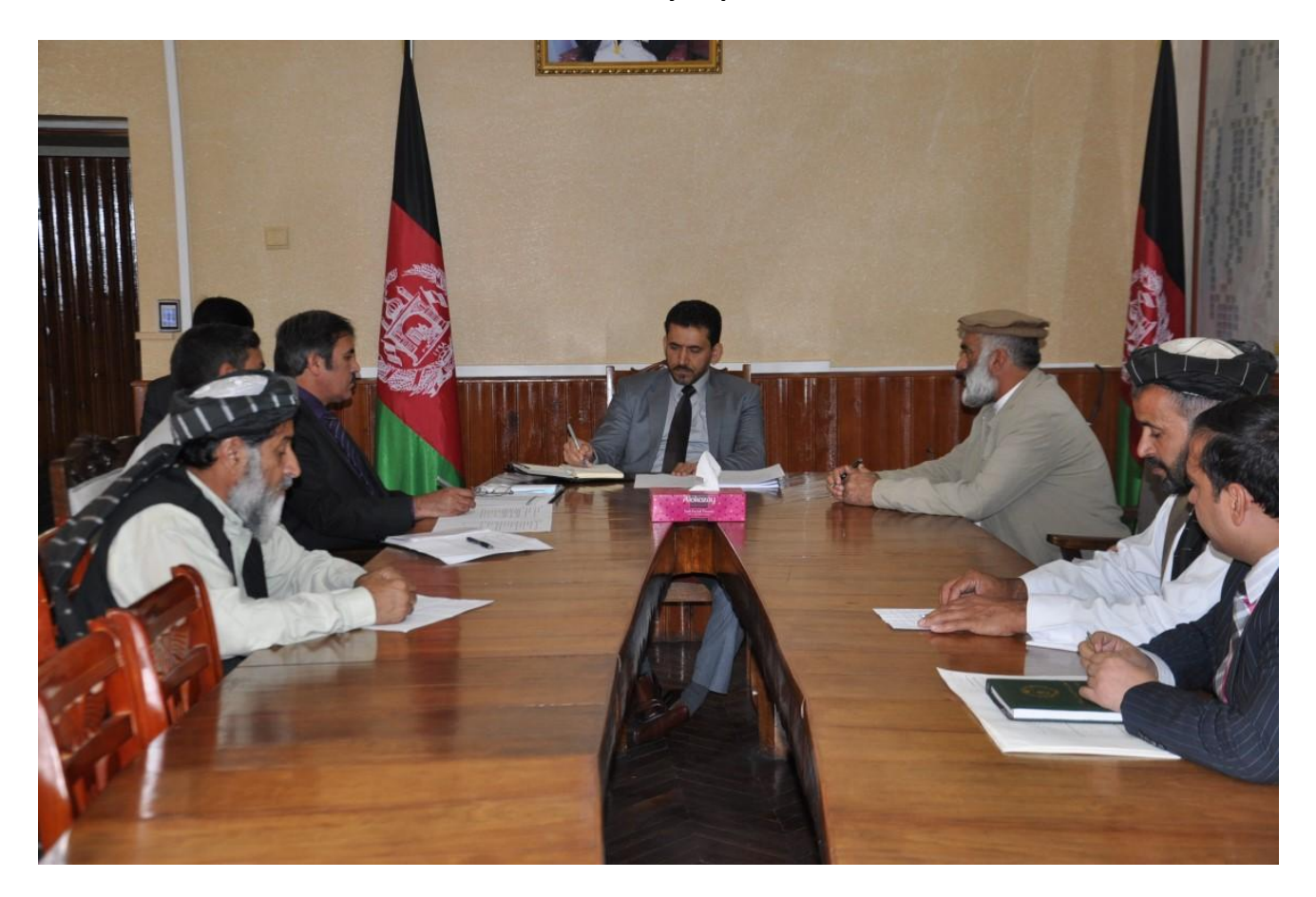
October- November 2016