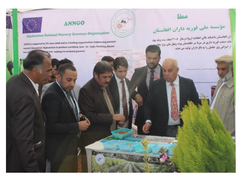
Photo # 6 Visit of Kabul governor and DAIL director from ANNGO Booth

During three days groups of people were visiting ANNGO booth and ANNGO technical staff has given technical information such as nurseries, certified sapling, NGAs, Marketable varieties, rootstocks, ornamentals....etc to the visitors.