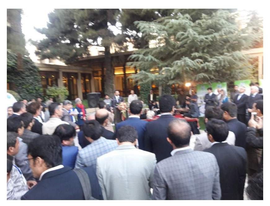
Photo #8 Speech of HE MAIL minister during Agro-Fest in Serina Hotel

from 4:00 pm to 8:00 pm. ANNGO team also present the catalogues of ANNGO with different fruits that were collected from provinces.