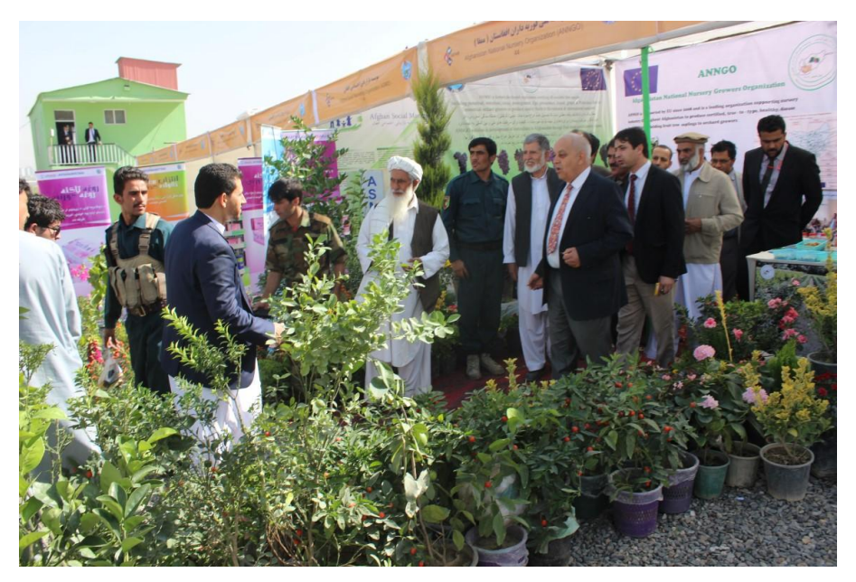
Photo # 7 Visit of HE MAIL minister and Kabul Governor from ANNGO booths

During three days groups of people were visiting ANNGO booth and ANNGO technical staff has given technical information such as nurseries, certified sapling, NGAs, Marketable varieties, rootstocks, ornamentals....etc to the visitors.