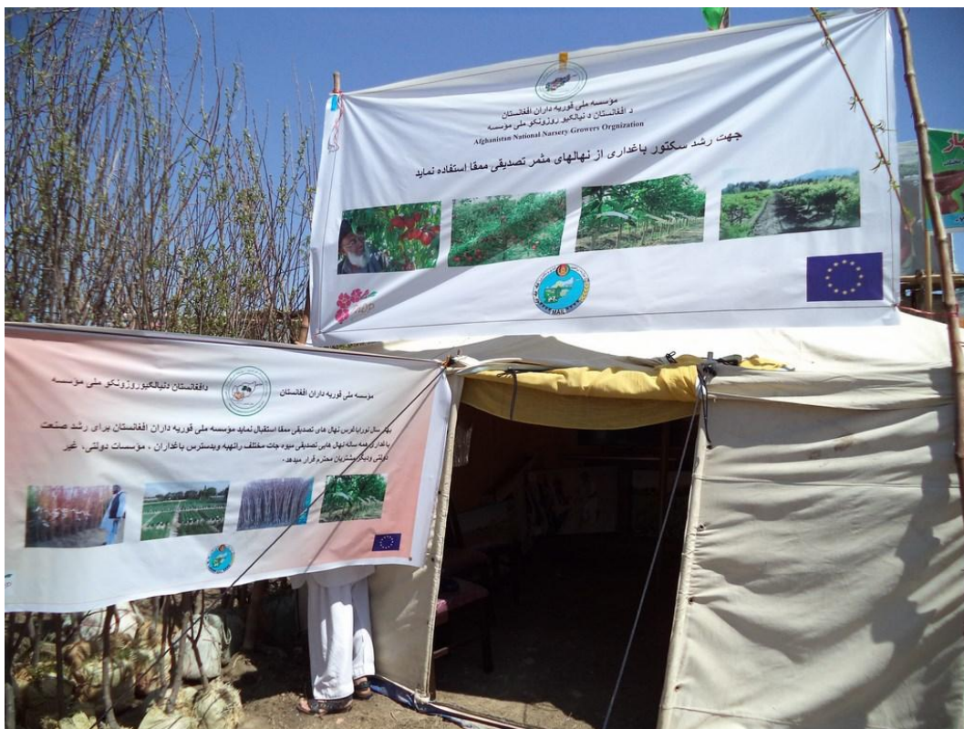
Fig. 10 Information center established by ANNGO during sale of saplings early this year.