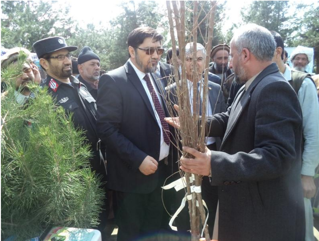
Fig. 7 Takhar NGA chairman offering certified saplings to Takhar Governor during Ag-Fair in Takhar