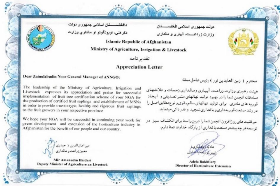
Fig. 1. MAIL appreciation letter to ANNGO