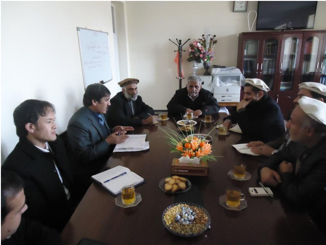
Fig. 9 ANNGO GM providing information to Nuristan Governor about ANNGO activities