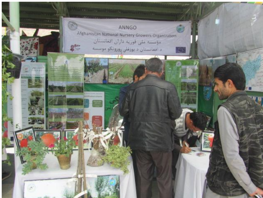
Fig. 6 ANNGO booth in Badam bagh during Ag-Fair