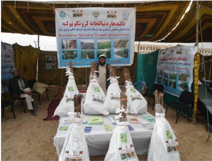
Fig . 5 Kandahar NGA participation in Kandahar province, representing ANNGO to participants