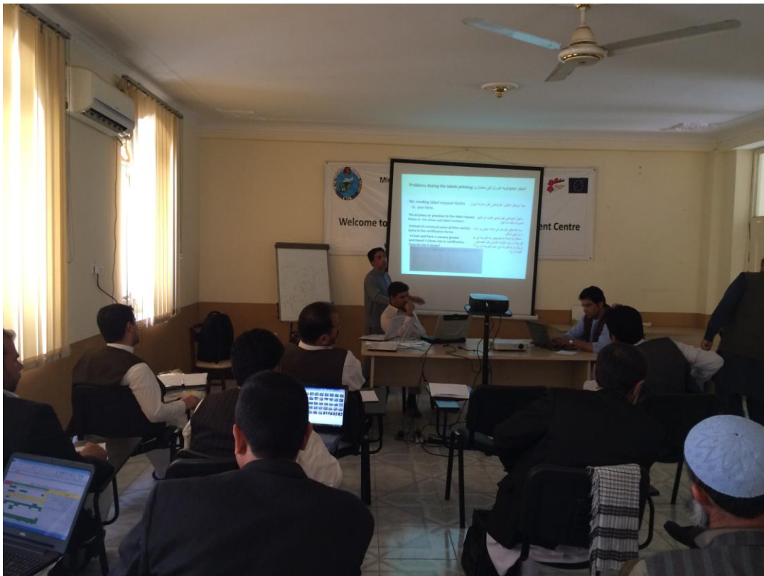
Fig. 8 Field managers training programme in Farm-i-Jadid Nangarhar