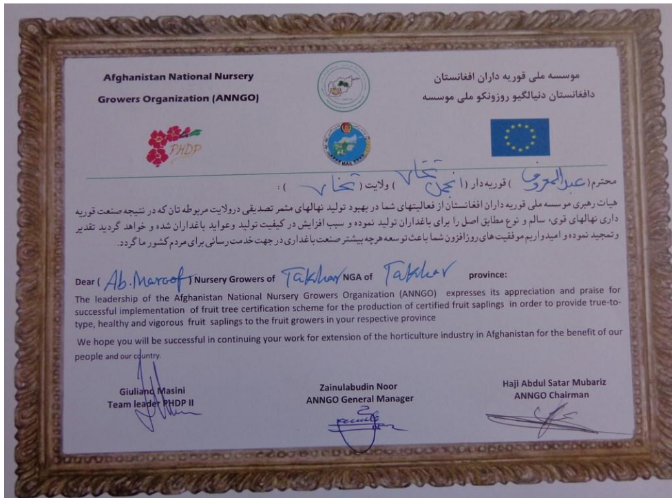
Fig. 2. ANNGO award to NGA members and best nursery growers