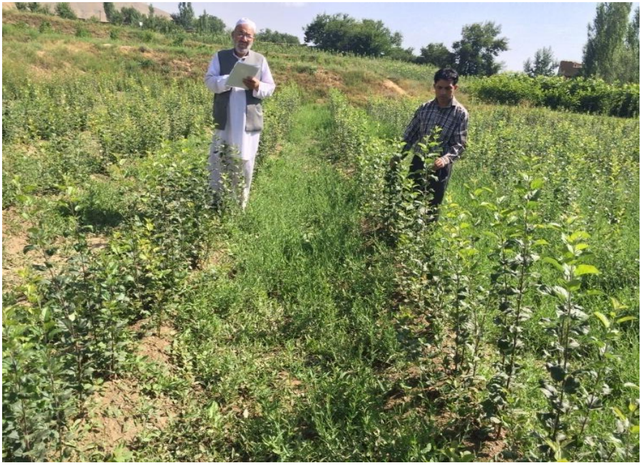
ANNGO inspectors during inspection of MSNs in Maidan province