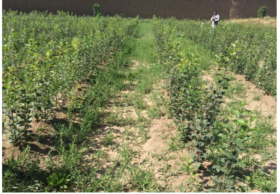
Apple clonal rootstocks newly planted for multiplication

Name of the contact person for the Action: Zainulabudin Noor